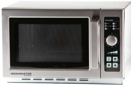
Model MCS10DSE shown