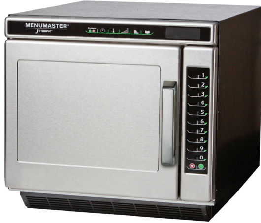
Model JET19 shown